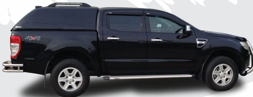
XTC Commercial Edition